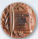
2013 & 2012 JESSE H. NEAL AWARD WINNER